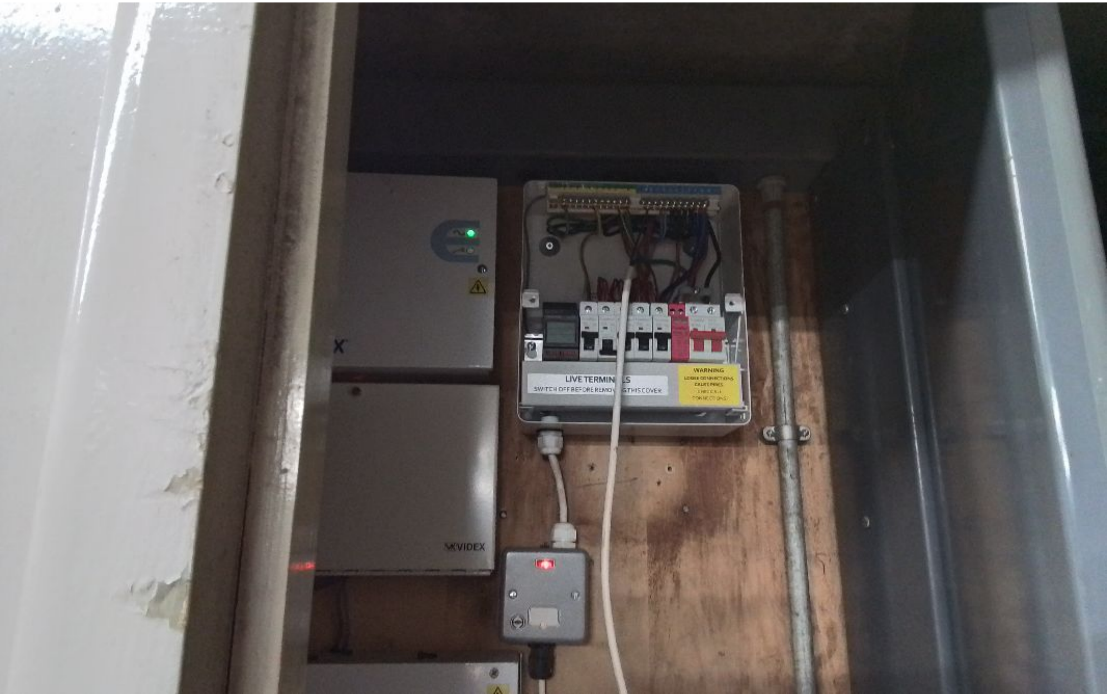
Stair Lights CU